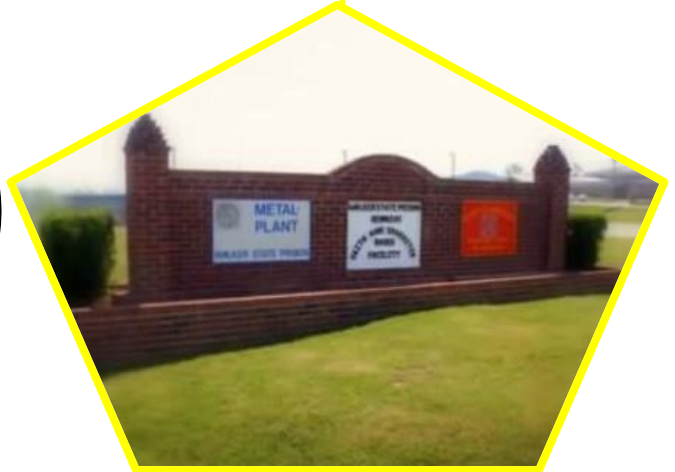
Main Entrance to Prison – “Bunker”